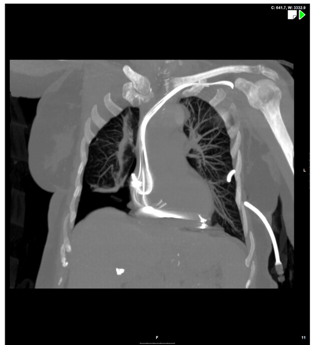
Figure 2. CT chest performed on post-procedure day 3 confirming no atrial lead perforation. Lead shadow/artifact remains within the right atrium, further suggesting that the actual lead is within the chamber.