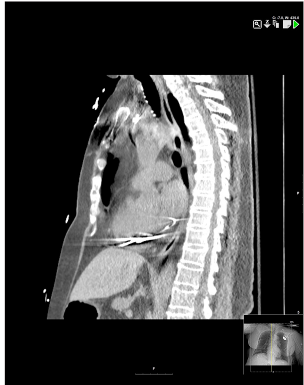
Figure 4. Sagittal view of CT chest confirming absence of fluid or air in the pericardial space.

This case is unique in that the patient developed bilateral pneumothoraces and, more importantly, the contralateral pneumothorax occurred several days after the procedure. Left-sided (ipsilateral) pneumothorax is a known complication