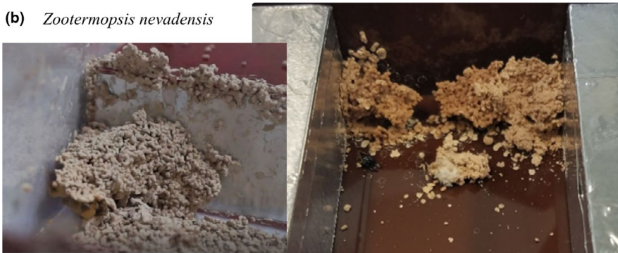
FIGURE 3 Pictures showing shelter tubes constructed by (a) Hodotermopsis sjostedti and (b) Zootermopsis nevadensis . Observations were made under laboratory conditions. The shelter tube construction was stimulated by starving condition and nest damage

structures can be distinguished in terms of their complexity; tunneling is mainly performed by excavation and can be considered as an extension of feeding activities (Emerson, 1938), while shelter tube construction requires specific deposition patterns to form tube-like structures. We collected literature data to shed light on the evolution of shelter tube building abilities in termites. We focused our endeavors on the 150-million-year-old lower termites, which form a paraphyletic group including all termites but Termitidae, as they can provide insight into the origin of termite social systems (Abe, 1987; Inward et al., 2007). We did not further consider the 50-million-year-old higher termites (all Termitidae) in this paper.