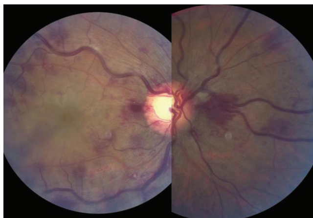
Figure 1. Color Fundus photograph of the right eye showed superficial opacification of the retina in the macular area in combination with multiple dot-blot and flame-shaped hemorrhages in all four quadrants (including the area nasally to the optic nerve).

Patient was prescribed aspirin 81 mg daily. Amlodipine 10 mg, and Hydrochlorothiazide 25 mg were added to