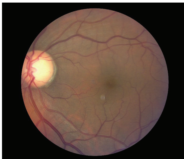
Figure 2. Color Fundus photograph of the left eye showed normal optic disc, and flat macula (normal findings).

Patient was advised to follow closely during the next six months, including gonioscopy and undilated examination of the iris to check for neovascularization of the iris/disc.