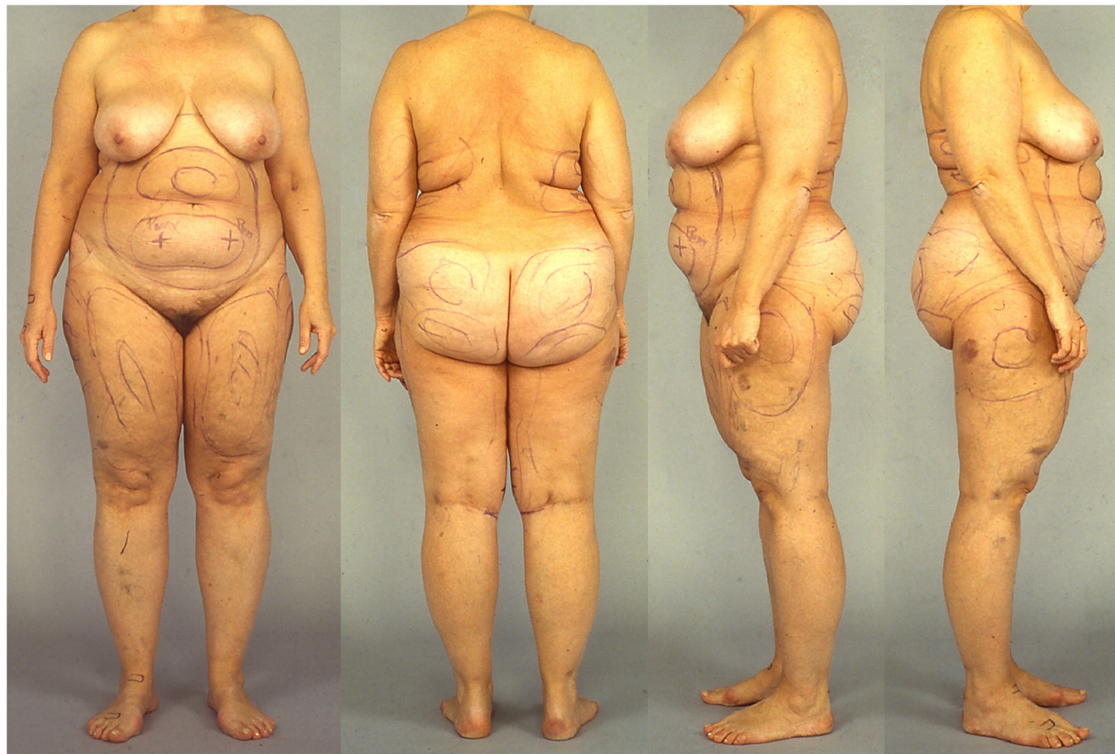
Figure 3 Patient with Dercum's disease. The patient has type I Dercum's disease, a generalised diffuse form encompassing diffusely widespread painful adipose tissue without clear lipomas. The markings are preoperative markings before liposuction. Written informed consent was obtained from the patient for publication of this report and any accompanying images.

subcutaneous adiposity he did not fulfil the criteria for Dercum's disease and it is hence unclear if this condition should be classified as a separate entity. Furthermore, contrary to in Dercum's disease, it was not the fatty masses themselves that were painful, but they caused pressure on other structures and subsequent pain.