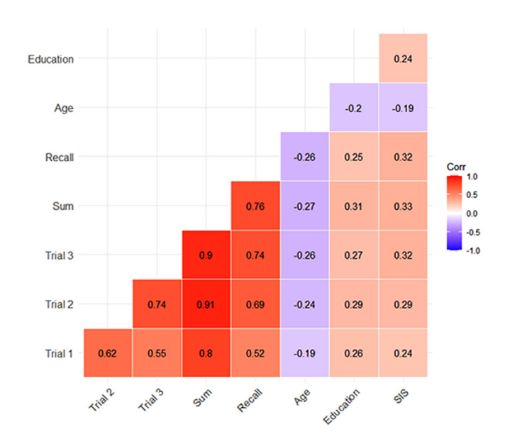
FIGURE 2 Correlation plot of Brief Spanish-English Verbal Learning Test (B-SEVLT) individual trials, sum, and recall; age; education; and Six-Item Screener (SIS) score