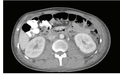
FIGURE 2: CT abdomen demonstrating extensive retroperitoneal fat stranding. These changes were later determined on autopsy to represent abdominal involvement of ALCL, which was present in mesenteric and retroperitoneal lymph nodes.

2.2. Physical Examination. Upon transfer and admission to our institution, his vital signs were within normal limits: temperature of 98°F, heart rate of 69 beats per minute, blood pressure of 112/72, respiratory rate of 12 breaths per minute, and oxygen saturation of 92% on room air. On exam, he was noted to have nonmobile and tender left mandibular swelling. His eye exam showed red scleral injection without exudate and a grey-brown ring around the irises. Neck exam revealed posterior left cervical lymphadenopathy that was hard, fixed, and painful. The remainder of the HEENT exam was unremarkable. Lungs were clear to auscultation bilaterally, and the cardiovascular exam was within normal limits. The abdomen was soft, nontender, and nondistended. Pulses were 2+ bilaterally, and the neurological exam was nonfocal.