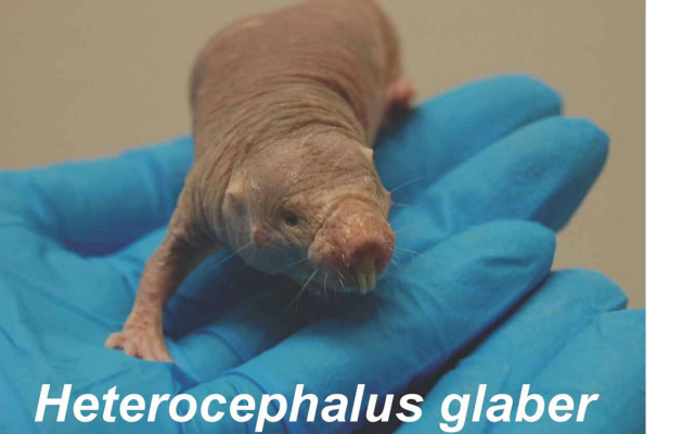
FIGURE 1 | Images of naked mole rat (right) and blind mole rat (left).