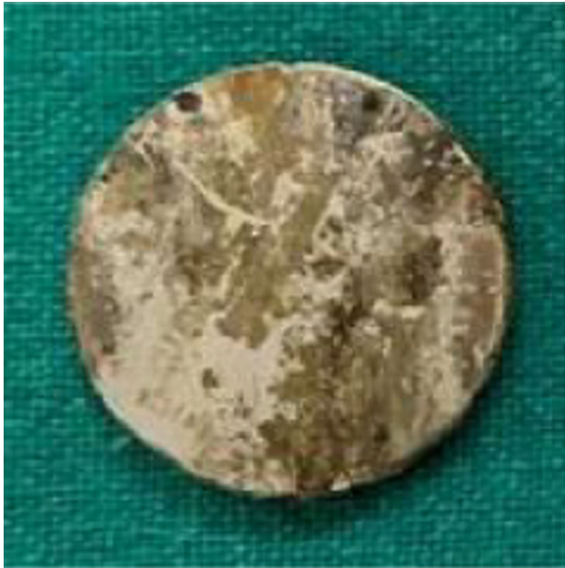
Fig. 1 Foreign body battery cell