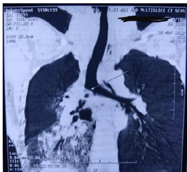
Fig.3 Foreign body at right main bronchus

positive clinical diagnosis of bronchial foreign body in children is often difficult. When classical symptoms of foreign body aspiration are absent foreign body can often be missed. Such patients in absence of definite clinical diagnosis are treated as pneumonia, laryngitis and COPD causing delayed in diagnosis and eventually land up with complications [11]. Chest radiography is usually the first diagnostic study ordered, with a reported sensitivity and specificity of 72% to detect abnormalities consistent with a foreign body aspiration. Recent progress in medical imaging, with the development of MDCT has decreased the acquisition time and improved image quality. 3D images on the basis of MDCT can provide virtual tracheobronchoscopy and confirmation of bronchial foreign body. In absence of such imaged radiological findings any interventional procedures can be avoided in current pandemic era. MDCT can be performed in children with minimal radiation risks [12].