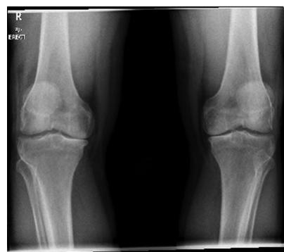
Figure 2 Standing anteroposterior radiograph of a 58-year-old male patient with significant bilateral narrowing of the medial aspect of both knees (femorotibial joints), illustrative of loss of the articular cartilage with advancing osteoarthritis.

In clinical practice, if a symptomatic patient with KL Grade 2 or 3 OA presents with knee pain, first-line therapy typically comprises treatment with a non-steroidal anti-inflammatory drug, and potentially an intra-articular injection of a corticosteroid to reduce effusion. A review of the patient 8 to 12 weeks later is conducted to assess treatment success, or to determine whether short-term pain alleviation (e.g., for 6–8 weeks) has waned and pain has returned. The latter patient characteristics indicate an appropriate candidate for treatment with a high MW, non-avian-based HA injection, such as NASHA. Based on the review of the clinical data reported herein for NASHA, successful pain relief would be expected to last for at least 6–9 months following such treatment. Repeat injections would be expected to yield a similar result, at a minimum, with longer effectiveness anticipated in the majority of patients who were responsive to initial treatment. A case study from one of the authors (RL) demonstrates this concept in practice for a 58-year-old male with painful bilateral knee OA (Figure 2) who received initial treatment with MPA steroid. Despite initial pain relief, symptoms returned after 6–8 weeks. Subsequent treatment with NASHA was effective for 9–12 months, and the patient has received yearly injections of NASHA for the past 5 years with beneficial results.