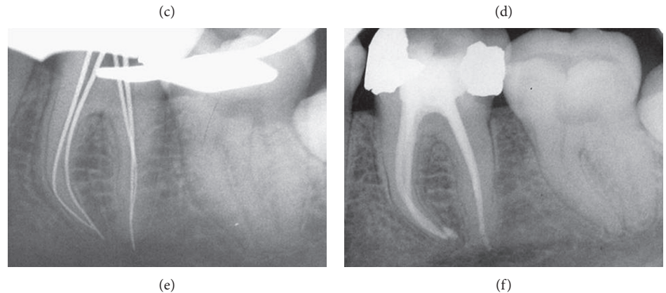
FIGURE 4: Radiographic views of root canal fillings. (a) Preoperative view of tooth 33; (b) obturation with SystemB/Obtura II; (c) accidental perforation on tooth 37; (d) sealing of the perforation with resin-modified glass ionomer cement and canal filling with SystemB/ObturaII; (e) retroalveolar view of tooth 36; (f) obturation with Thermafil.

There is a general agreement around the relation between coronal restoration quality and ETO. A strong statistically significant difference was found in the present study between definitive and temporary restorations. In fact, higher success rates (94%) were found with teeth adequately restored using composite resin or amalgam. Dawson et al. [44] reported no differences in AP frequencies between teeth adequately