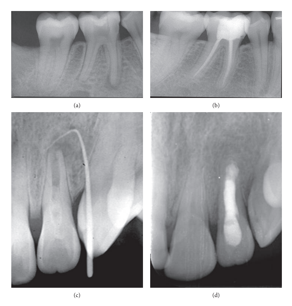
FIGURE 1: Healed AP. (a) Preoperative view of tooth 46 (PAI = 4), note the resorption of the distal apex; (b) healing at 2-year follow-up (PAI = 0); (c) preoperative view of tooth 22 (PAI = 4), with immature apex; (d) healing at 2-year follow-up, note the apical closure around the MTA plug (PAI = 0).

based on the Endodontic European Society guidelines [29] and Wu et al. criteria [32]. The results revealed that prognostic factors significantly affecting ETO are pulp status, apical periodontitis, and coronal restoration. Gender, tooth location, number of sessions, intraoperative complications, and level of root canal filling are not likely to be associated with ETO.