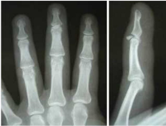
Figure 1: Antero-posterior and lateral radiographs of (L) middle finger showing mallet fracture with dorsally displaced intra-articular fracture fragment from the base of the distal phalanx involving about 50 % of the articular surface without comminution and volar subluxation of the distal phalanx.