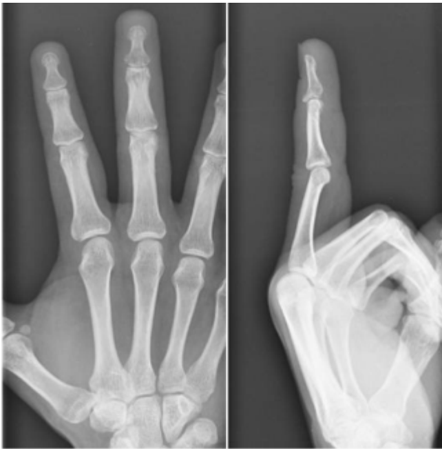
Figure 3: Antero-posterior and lateral radiographs at 3 months follow up. No extensor lag present. Joint space is congruous with no joint space narrowing.

Good- 0-10 degrees of extension deficit, full flexion, no pain; Fair- 10-25 degrees of extension deficit, any flexion loss, no pain; Poor- More than 25 degrees of extension deficit or persistent pain. In this case the result was “excellent” as per Crawford's criteria, and patient had full DIP joint extension, full flexion, no pain with no medio-lateral instability.