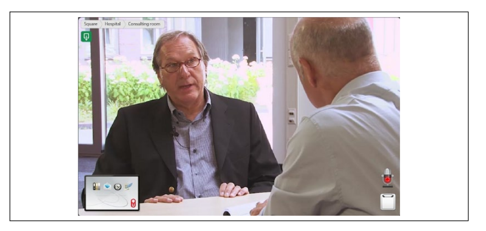
Figure I. A patient being interviewed. At the bottom left, we see the tablet, and at the bottom right, we see the memo recorder and notepad.

feedback can incorporate mail attachments or the release of resources, such as workedout examples or expert reports. The student gets navigation support through alerts, e.g., reminders for meetings or instructions for where to go next.