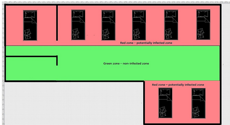
FIGURE 1: Red and green grading zones

Since isolation rooms and cohorting MDRO-positive patients were not feasible, we divided the open-plan ICU space virtually (rather than physically) into two grading zones (red and green zone) (Figure 1) followed by behavioral restrictions to be applied, along with contact precautions, to all patients from their admission to the discharge or death (universal use of contact precautions) based on these zones.