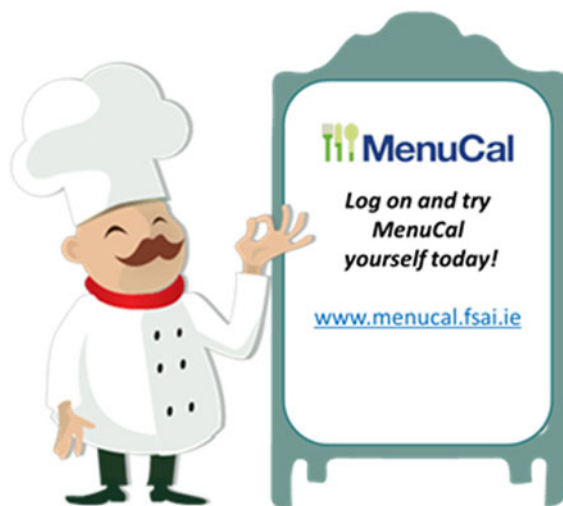
Fig. 2. (a) and (b): Putting calories-on-menus in Ireland: Ollie the Chief tells you all about MenuCal - a calorie calculator designed to enable food businesses to calculate and display the calories in the food they serve.

(b) MenuCal incorporates an interactive step-by-step training programme designed to enable staff in all food business use MenuCal