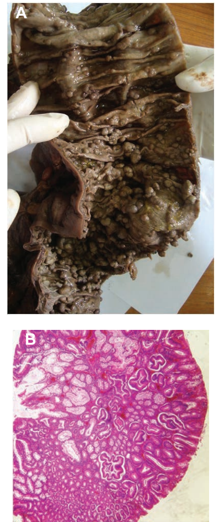
Figure 2. Macroscopic and histologic features of colonic adenomatous polyposis: A) numerous colonic polyps of various sizes; B) tubular adenoma with low-grade dysplasia (HE×200).