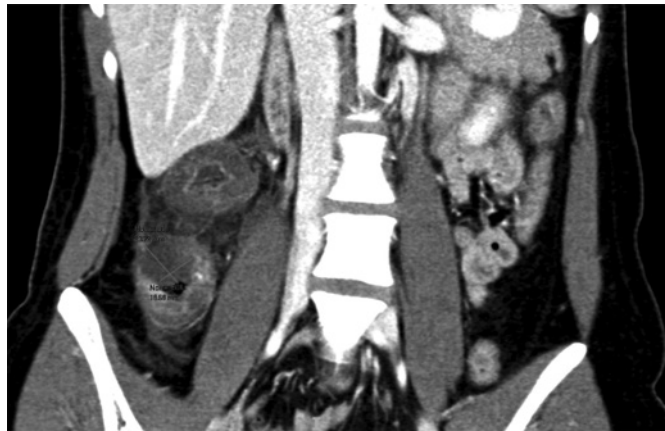
Fig. 1. CT scan image.

considered as a contraindication to surgery [39]. The mortality rate is high (32–50%), although it has been improving in recent years thanks to more efficient medical treatments [13].