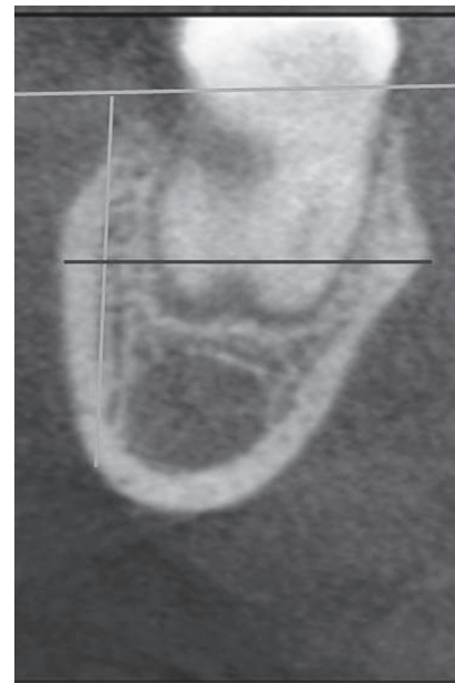
Figure 5 - Buccolingual bone depth at 6 mm and 8 mm.