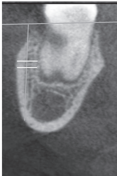
Figure 4 - Buccal cortical bone thickness at 6 mm and 8 mm.