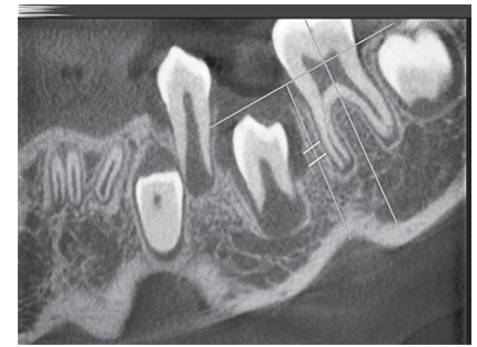
Figure 3 - Mesiodistal bone width at 6 and 8 mm.