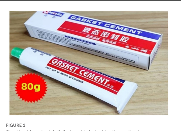
The liquid sealant (nitrile type) inhaled by the patient.

The following parameters were recorded upon physical examination on admission: temperature ( 36.3^{\circ} C), pulse rate (70 beats/min), respiration rate (16 breaths/min), and blood pressure (105/58 mmHg). The patient's general condition was poor; he was conscious but had slow reactions and difficulty talking. Yellow staining was not observed on the skin or mucous membranes, and there was no swelling of the superficial lymph nodes. The pupils were large and round bilaterally, with a diameter of ~3 mm, and sensitive to light reflection. Neither cyanosis of the lips nor pharyngeal congestion was detected. No abnormal masses were palpated in the neck. Both sides of the