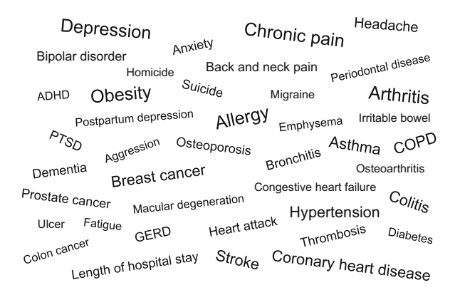
Fig. 2 Health conditions linked to the highly unsaturated fatty acid (HUFA) balance. ADHD attention deficit–hyperactivity disorder, COPD chronic obstructive pulmonary disease, GERD gastroe-sophageal reflux disease, PTSD post-traumatic stress disorder

Occupational medicine experts have identified dozens of chronic health conditions other than CVD that cause major health-related financial losses for US corporations [15, 16]. Many of these conditions (see Table 1 in Ref. [8]) are made worse by excessive n-6 actions, and the HUFA balance is linked to financial loss (see Fig. 2 in Ref. [14]). The balance of n-3 and n-6 HUFA in blood lipids [17] is a valuable surrogate for monitoring food-based interventions. Ironically, CVD (the top cause of death) is not among the top ten conditions causing health-related financial losses (see Fig. 1 in Ref. [15]), and many other food-based health conditions with excessive actions of n-6 eicosanoids [16, 18] cause the top ten financial losses [15]. Interventions with fish oil that lower the HUFA balance and the prevalence of CVD and n-6-mediated comorbid conditions will likely give large overall benefits measured in terms of lower health-related financial losses and a greater sense of wellbeing [14, 16, 18].