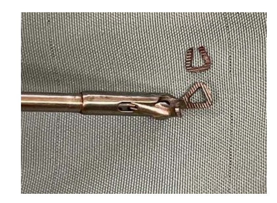
Figure 2. The dislodged limb from the heart-shaped micro-grasper.