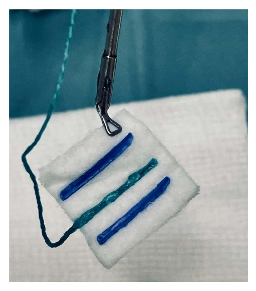
Figure 3. The heart-shaped micro-grasper as compared to an adrenaline pate.

to be checked for integrity before sending to the operating theatre.