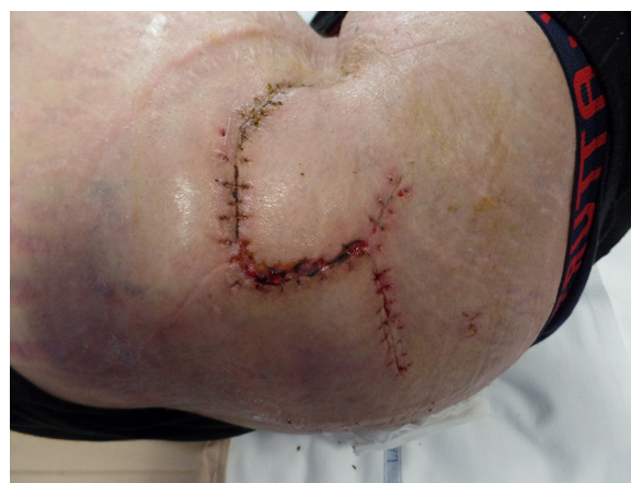
Fig. 7. Two months after the surgery, the wound is healed with no signs of infection.

The whole procedure took 45 min of operative time.