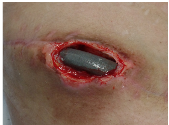
Fig. 3. The wound after a first surgical debridement.

A surgical decompression was planned and adjuvant chemotherapy was administered (Vincristine, Temozolomyde and Irinotecan).