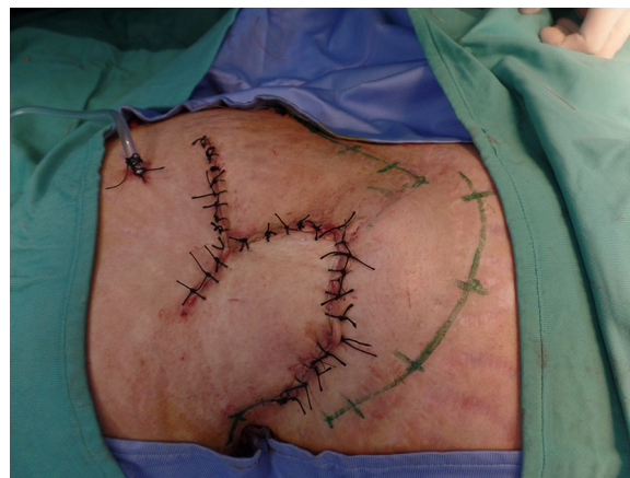
Fig. 6. The wound at the end of the surgical procedure.