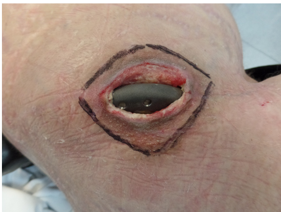
Fig. 4. The wound after 4 weeks of Negative Pressure Therapy.