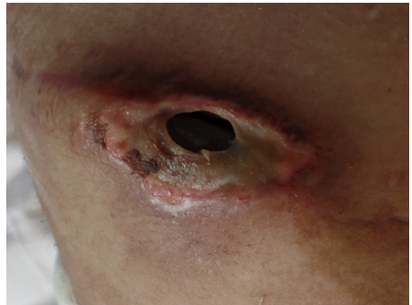
Fig. 2. Dehiscence of the hemipelvectomy wound with exposure of underlying implant.

For that reason a MRI was scheduled and came back positive for disease recurrence at level of processus spinosus of ninth and tenth thoracic vertebrae, with intracanalicular extension in the posterior epidural space causing compression of the spinal chord. (Fig. 1)