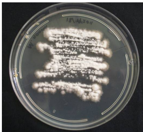
Fig. 1 – Culture of Microsporium nanum on Sabouraud dextrose agar with chloramphenicol.

There was no significant difference in gender distribution: eight males and 10 females were affected. M. canis affected both men (4/10) and women (6/10) as did M. gypseum (four males and three females affected) and M. nanum