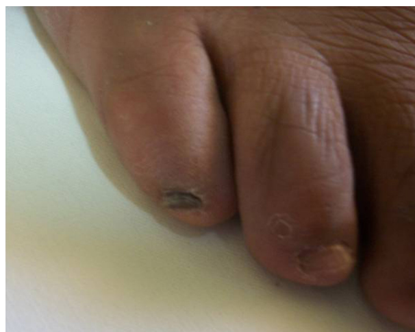
Fig. 3 – Total dystrophic onychomycosis due to Microsporium nanum .

The duration of Microsporium onychomycosis prior to presentation at our Institute varied widely, from one month to 20 years (mean 6.55 years). Only three patients sought medical care with disease duration of one year or less, one of them had M. gypseum onychomycosis. The others had suffered from onychomycosis for many years. None of the patients had tinea