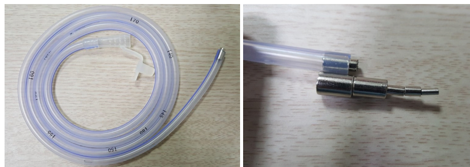
Fig. 3. Magnetic tip Levin tube.

The success rate of this procedure is higher if a stronger magnet is attached to the tube, a smaller FB is being removed, and if the FB is of a magnetic material rather than iron-containing FB. Older age and better cooperation from the patient may be factors that could also improve the success rate. Therefore, sedation may improve the success rate, particularly in extremely young or highly apprehensive patients. In several cases, the administration of sedatives relaxes the esophageal sphincter and spontaneously expels the FB. The success rate