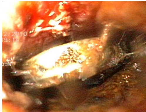
Fig. 1. The image shows disk battery impaction in the upper esophagus of a 23-month-old infant, causing adjacent ulcers and surrounding mucosal edema in the patient. The battery could not be removed despite several trials using various devices including a rigid esophagoscope, a flexible pediatric endoscope with a pediatric rat-tooth grasping forceps, a larger adult-size endoscope with pelican type grasping forceps, as well as the prior unsuccessful attempts to push it further into the stomach. The outer cap of the device used for endoscopic variceal ligation was applied at the end of an adult endoscope, which was used concomitantly with the pelican-type grasping forceps, to successfully extract the disk battery from the infant.

When the FB itself is expected to cause or has already caused injury to the GI tract, the timing of removal is important in that case. Prolonged retention of disk batteries in the GI tract may cause pressure necrosis of the GI mucous membrane, heavy metal poisoning, and corrosion secondary to the battery solution [11]. Notably, esophageal FBs may cause complications including ulcers, perforations, and fistulas in that region of the body ( Figs. 1 and 2 ). Symptomatic FBs require emergency removal within 2 hours if excessive oral secretions are not controlled, regardless of the location. In asymptomatic cases such as coin impaction, urgent removal is required within 24 hours [12]. We use an orogastric Levin tube in special situations for the removal of disk batteries lodged in the mid-to-lower esophagus, if endoscopic removal is not possible to use immediately in that case.