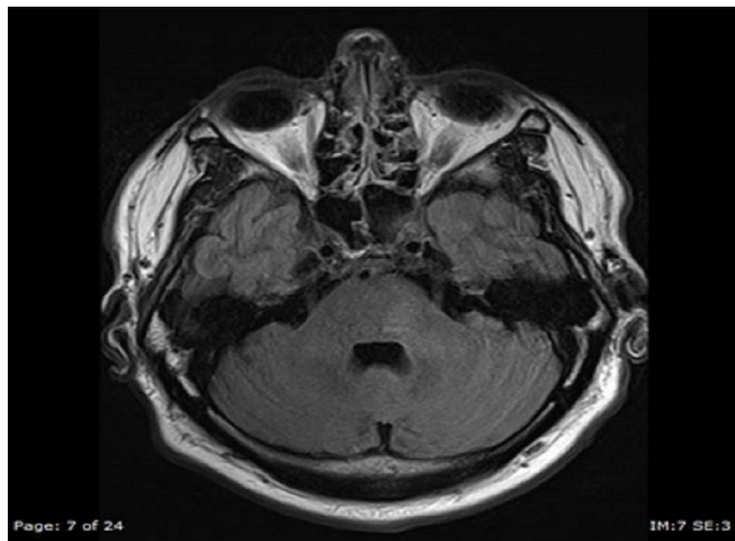
Figure 1 MRI.

picture was suggestive of the possibility of multifocal astrocytoma or a low-grade glioma. Figure 1 shows these features on the MRI scan. Figure 2 shows spectroscopy finding of increase choline that is compatible with a low-grade glial tumour. No biopsy was done as it was deemed too much of a risk at the time. The tumour was observed over time and treatment with radiotherapy was initiated in 2013 (50.4G/28#) as there were progressive symptoms with diplopia and dysarthria. Radiotherapy and a trial of steroid did not alleviate his symptoms, although his 6 monthly MRIs have remained unchanged.