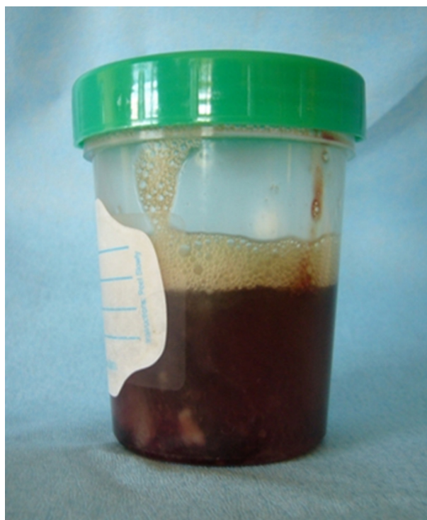
Figure 3 Hemoptysis contents with whitish material admixed on the sputum.

anticoagulated with warfarin for 6 months. Radiological resolution and spirometry normalization (Table 1) occurred after 4 weeks, whereas, elevated AST were normalized only after 8 weeks.