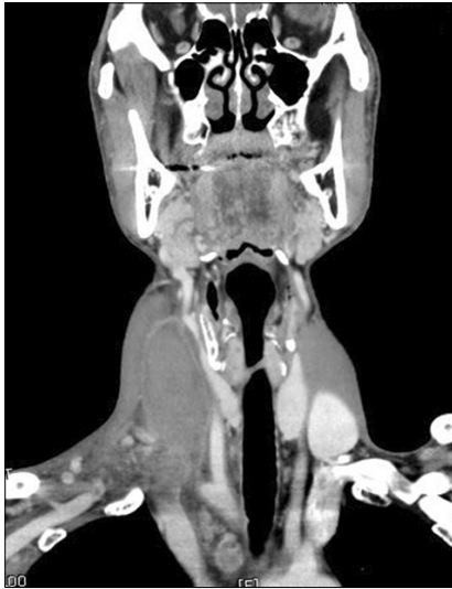
Fig. 1. Neck CT showing thrombosis of the right internal jugular vein and swelling of the right neck.