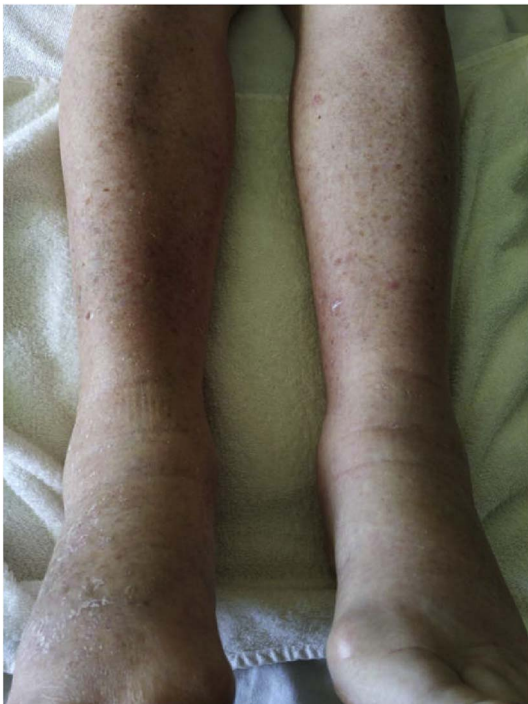
Fig. 1. Edema of the lower limbs with diffuse maculopapular rash.

Computed Tomography (CT) scan of the chest was performed, which clearly showed multiple peripheral ground-glass opacities with consolidation in both lungs (Fig. 3). Pulmonary function tests showed a normal Forced Vital Capacity (FVC), FEV1 (Forced Expiratory Volume in 1 second) and FEV1/FVC (Tiffeneau Index) and a mild decrease in