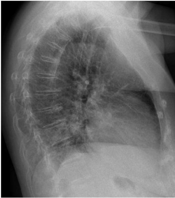
Fig. 2. Chest X-ray, profile incidence, at first presentation showing patchy retrocardial infiltrate.