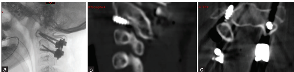
Figure 2: A patient undergoing C1-2 fluoroscopic-guided procedure for Os odontoid. (a) Demonstrates lateral fluoroscopic view. Post-operative CT scan reveals a malpositioned right C2 screw that was not evident on 2D fluoroscopy. Post-operative sagittal (b) and axial (c) scans demonstrate lateral and inferior screw breach (Grade 2).