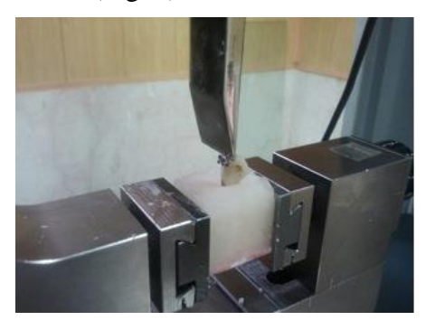
Fig. 1: Testing shear bond strength of metal brackets

Group D: Ceramic brackets (American Orthodontics, Radiance Plus, Sheboygan, WI, USA) with a nominal base area of 15.1mm<sup>2</sup> were bonded to the etched enamel and other steps were performed similar to other groups. The adhesive was light-cured conventionally for 20 seconds (10 seconds from mesial and 10 seconds from distal). The samples were mounted in a metal mold containing auto-polymerizing acrylic resin and thermocycled for 2,500 cycles between 5-55°C for 20 seconds at each temperature with 20 seconds of transfer time. Rectangular wires were used to match the central alignment of teeth in acrylic resin. All samples were subjected to SBS test in a universal testing machine (7060; Zwick Roell, Ulm, Germany) at a crosshead speed of 3 mm/minute (Fig. 1).