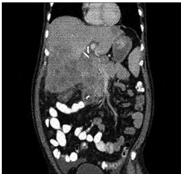
Figure 1: CT abdomen (coronal section) showing a large caudate lobe liver mass involving the gall bladder and common bile duct at porta with intrahepatic biliary radical (IHBR) dilatation

Autopsy series have demonstrated that metastasis to the gallbladder may occur in 4 to 20% of the patients with melanoma. Despite this statistic, it is rare for metastatic melanoma involving the gallbladder to cause symptoms during life. [6] As a result of the rarity of gallbladder melanoma cases, the diagnosis is often not suspected preoperatively. [7] Ultrasonic features may help to diagnose melanoma metastases preoperatively. Metastatic melanoma of the common bile duct (CBD) is very rare, with only 18 cases reported so far; [8] the most common presentation in these cases is of progressive painless obstructive jaundice