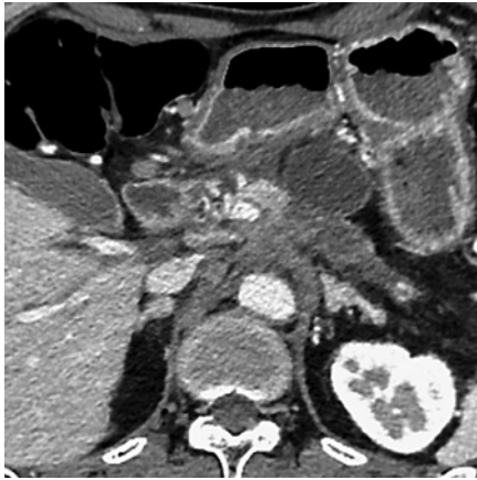
Fig. 1. Computed tomography showed a pancreatic pseudocyst associated with locally advanced pancreatic body carcinoma.