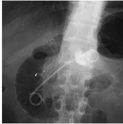
Fig. 2. Endoscopic transpapillary drainage was performed using a 7-Fr double pigtail.