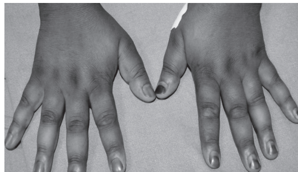
Figure 1. Showing Diffuse Hyperpigmentation Involving Extensor Surfaces of Hands

ides 193 mg/dL, low density lipoprotein levels (LDL) 190.4 mg/dL and high density lipoprotein levels (HDL) 33mg/dL.