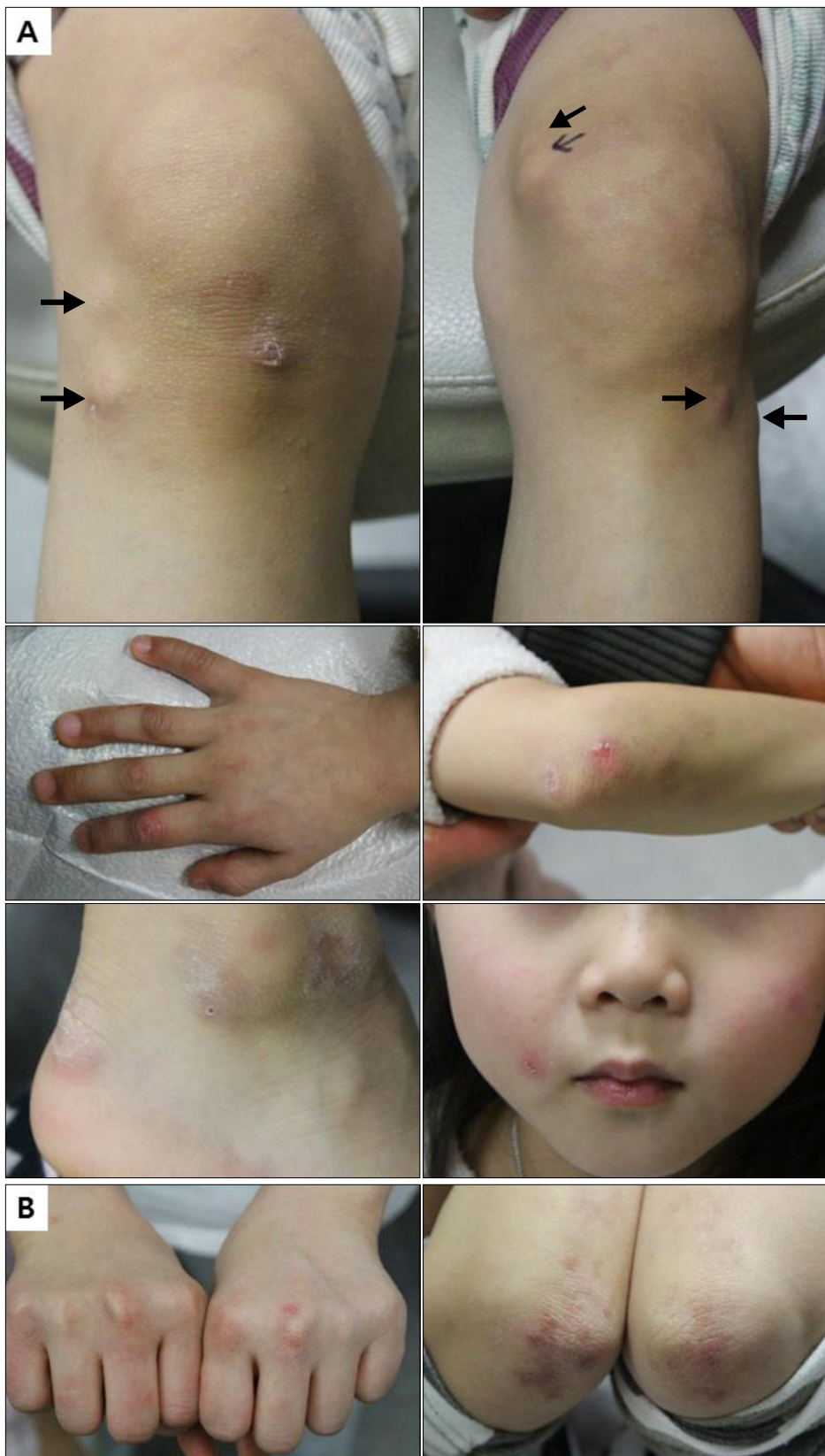
Fig. 1. (A) Skin manifestations of the patient. Subcutaneous nodules on both knees (black arrows, upper panels) and multiple erythematous scaly patches and plaques on bilateral knuckles, elbows, ankles and cheeks (middle and lower panels). (B) Skin manifestations of the mother. Erythematous scaly patches on the knuckles (left panel) and elbows (right panel).