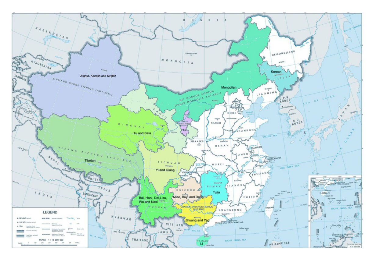
Fig. 1. The locations of 24 ethnic minorities sampled in China.

were the parameters to be estimated from the data. Age at menarche was estimated when p was equal to 10, 25, 50, 75, and 90% (25, 26). The ages at these values of p are equivalent to the corresponding percentiles of ages at menarche, e.g. 50% = 50th percentile age (the median age at menarche of the population). Differences in the percentages of menstruating girls among different ethnic minorities in 2010 were compared using the chi-square test, and differences in age at menarche between 1985 and 2010 survey points were tested by using z-test. A p-value less than 0.05 was considered as statistically significant. In order to facilitate the classification of ethnic minorities, age at menarche among the 24 ethnic minorities was examined by cluster analyses and cluster analyses adjusted for body mass index (BMI) were also conducted. All analyses were conducted with SPSS 20.0 (SPSS, Chicago, IL, USA).