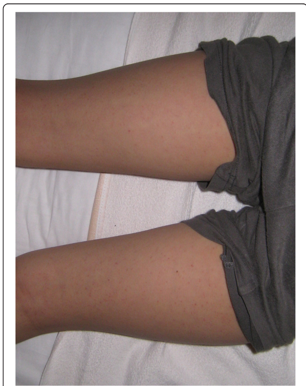
Figure 1 Petechial rashes observed on patient's legs at admission.

On admission, his temperature was 38.8°C, but he was in a stable condition. A 5×5-cm 2 mass was located on the right temporal region of his scalp. The mass was soft and non-tender without signs of inflammation. Petechial rashes were also observed on his oral cavity, trunk, and limbs (Figure 1). At the time of blood sampling, new petechiae easily developed at the tourniquet-compressed site. Table 1 shows the results of laboratory tests. On admission, platelet count and coagulation tests were normal, and mildly impaired white blood cell count and elevated C-reactive protein suggested the presence of a viral infection as the cause of fever. Computed tomography of the head showed subcutaneous hemorrhage without evidence of skull fracture or intracranial