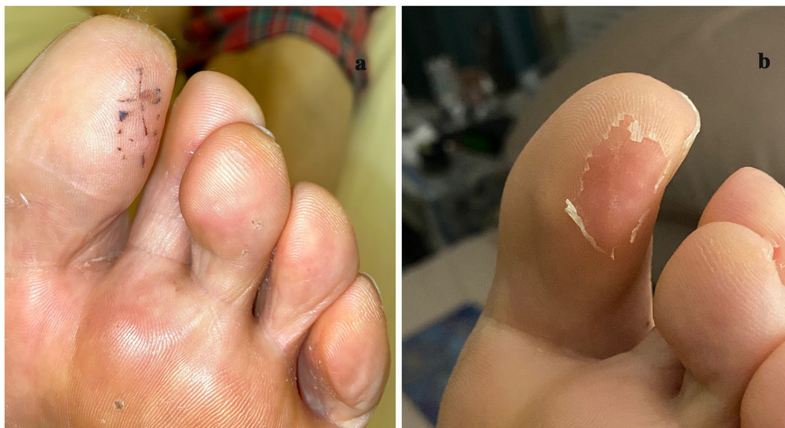
Fig. 4 Postoperative examination and subsequent follow up visit after complete removal of cellular digital fibroma from the left great toe of a 61-year-old man. The excision site of the cellular digital fibroma has completely healed when the sutures were removed at the follow up visit 2

weeks after the excisional biopsy (a). There is superficial desquamation of the epidermis surrounding the excision site and the surgical scar is faintly visible 3 weeks after the procedure was performed (b). There has been no recurrence of the cellular digital fibroma at 5 months follow up