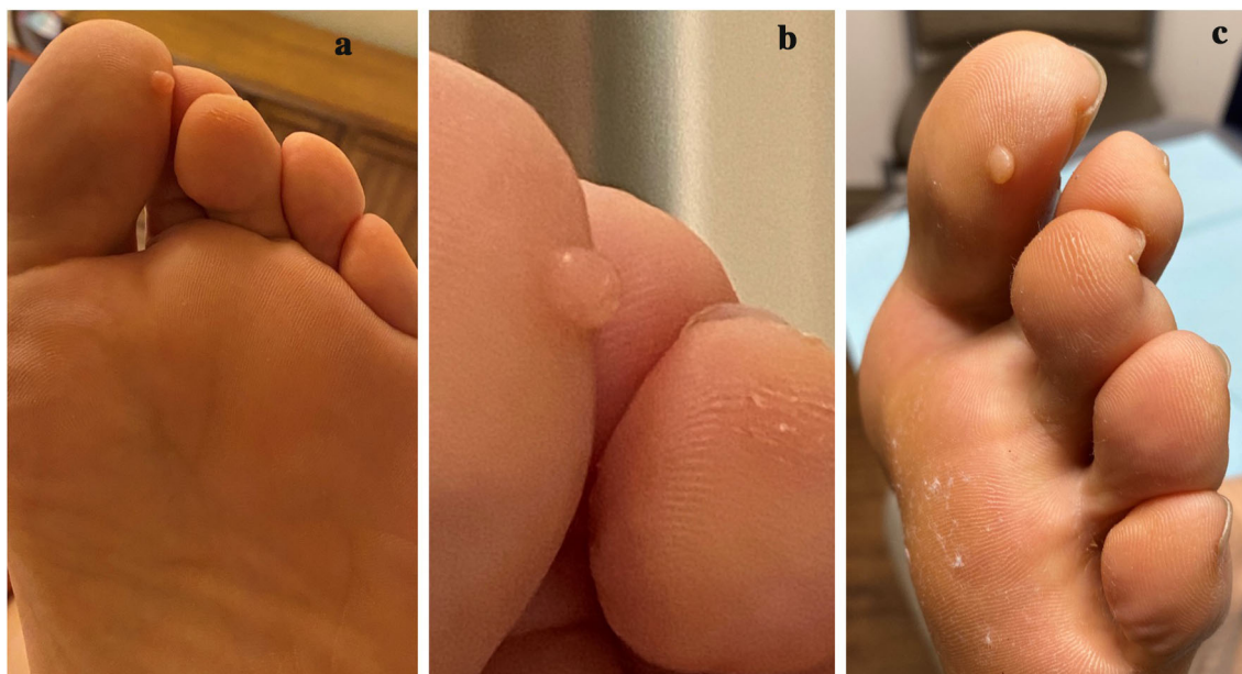
Fig. 1 Clinical presentation of a cellular digital fibroma on the left great toe. Distant ( a , c ) and closer ( b ), plantar ( a , b ) and lateral ( c ) views of a new asymptomatic flesh-colored 5 mm papule on the lateral side of the left great toe

A specific comments stating that the cellular digital fibroma was asymptomatic was only mentioned for the patient in this paper and 2 other men [2, 6]. A larger cellular digital fibroma on the proximal nail fold the right second toe of a 27-old-man was slightly painful on palpation [1]. The presence of symptoms was not described for any of the other patients with a cellular digital fibroma. This is in contrast to patients with superficial acral fibromyxoma in whom from 10% (4/41) [10] to 31% (5/16) [11] to 41% (19/46) [12] presented with painful tumors [13, 14].