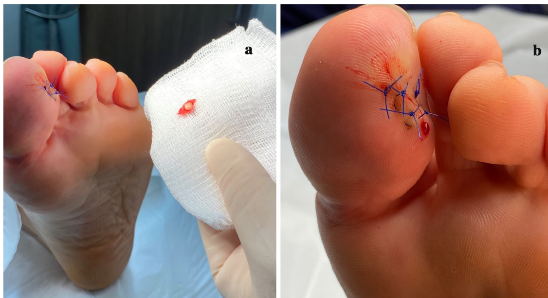
Fig. 3 Excision specimen of cellular digital fibroma that had been present on the left great toe of a 61-year-old man. Distant (a) and closer (b) views of the gross specimen (a) and the wound repair (a, b) following an elliptical

excisional biopsy of the cellular digital fibroma. The wound was closed with polypropylene (prolene) suture using two horizontal mattresses and three interrupted stitches