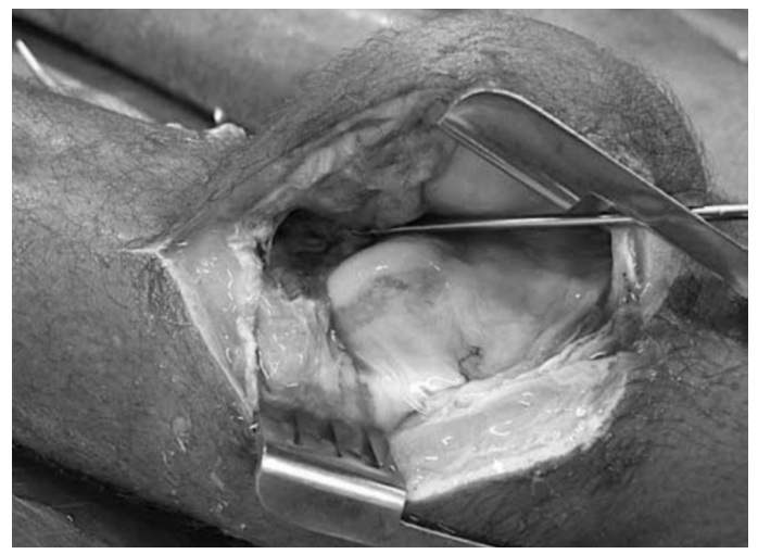
Figure 3 – Guidewire at the point of entry and area of the trochlea at the start of the cartilage: a point that was difficult to surmount with a malleable protector (not shown in this figure).