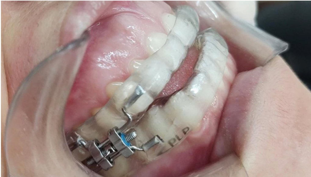
Fig. 1 Oral appliance in situ.