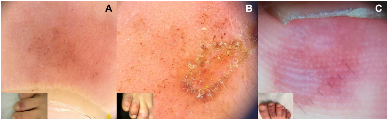
Fig 1. A , Dermoscopy findings of a classical erythematous-edematous lesion of the dorsal aspect of the toe showing a predominant coppery red background associated with dotted vessels and hemorrhagic dots. B , Dermoscopy of a blistering-type CBL showing a coppery red background associated with hemorrhagic dots and crusts. C , Another dermoscopic facet of a blistering lesion of the toe showing a white area corresponding to skin detachment. Note how the erythema is mainly distributed on the ridges. CBL , Chilblain-like lesions.