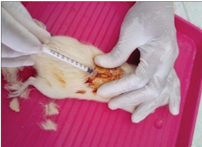
Figure 1: Scaffold application in subcutaneous rats