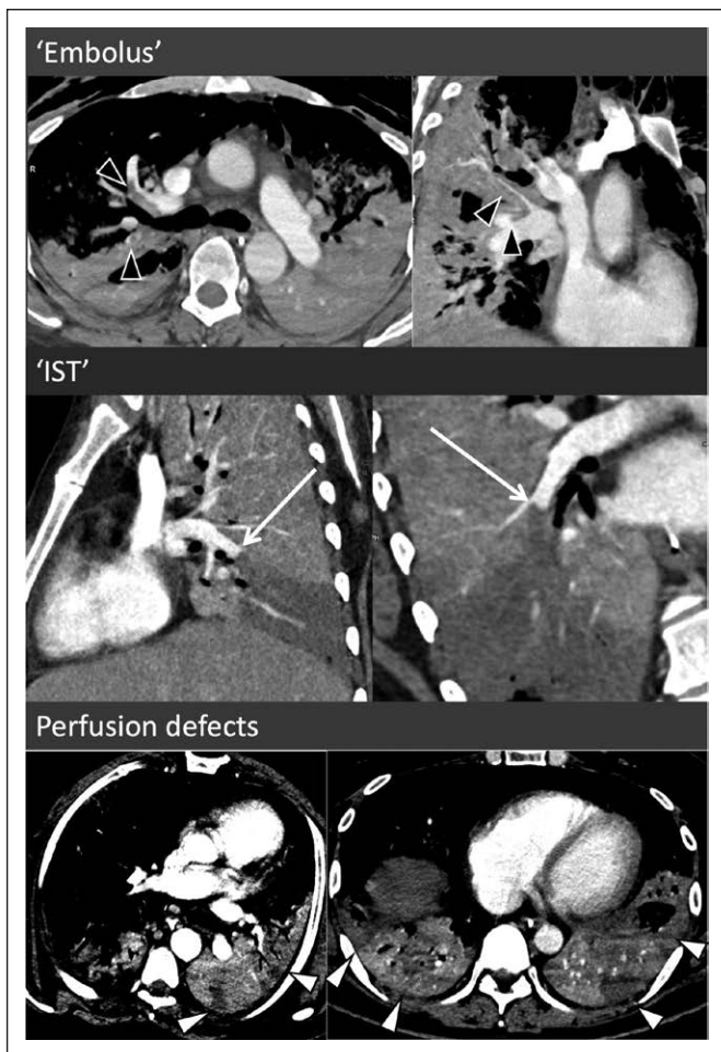
Figure 1. Morphologic features of pulmonary artery thrombus (PAT) and parenchymal perfusion defects. In the top two images, the PAT exhibits typical characteristic of multiple emboli with central filling defects with peripheral contrast opacification, extending into both branches at a bifurcation points with some of these exhibiting opacification of the pulmonary arteries distally ( black arrowheads ). In the middle two images, there is complete occlusion of the right lower lobe pulmonary artery with a large wedge perfusion defect in an area of severely disease lung. Rather than the classical crescent of an embolus, the clot is creeping along the outer edge of the vessel toward a more proximal branch ( white arrow ). The bottom images demonstrate two examples of parenchymal perfusion defects. IST = in situ thrombus.

morphology was considered indeterminate. To assist in intercenter homogeneity of classification, slides with the above criteria were circulated to each center with several exemplar images of each classification contained within this. For this classification, a single reader at each center reread all the studies with PAT. Any initially scored as indeterminate was reread with the lead center before final classification was assigned. For severity, the PAT was characterized as unilateral versus bilateral, extent of distribution (central, branch,