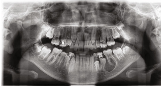
FIGURE 1: Pre-Op Orthopantomograph showing a well-defined radiolucent lesion in the left posterior mandible.

The patient was kept on a maintenance dose of 10000 D3 I.U weekly. Based on progress in clinical, laboratory testing, and imaging of the jaw lesions (Figure 2(c)), the parents declined any surgical intervention, including biopsy, and agreed to pursue periodic follow-up. A Radiograph was taken at nine months, followed by further progress with new bone formation (Figure 2(d)). 4Repeat laboratory analysis also showed regular intact PTH 49.3 (15-68) pg./ml, vitamin D (25(OH)D) 73.3 (30-100) ng/ml and calcium 2.5 (2.15-2.60) mmol/L. The patient proceeded with 10,000 D3 I.U weekly and followed up with 18-month post-medical action. The last Panoramic picture showed a full resolution of the lesion (Figure 2(e)), and the laboratory tests confirmed stable values