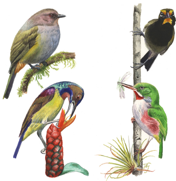
Figure 1. Four bird species representing a nonendemic and an endemic species to Wallacea (left) and the West Indies (right). Upper left: Olive-flanked Whistler ( Hylocitrea bonensis ) endemic to Sulawesi, the largest island in Wallacea. Lower left: Brown-throated Sunbird ( Anthreptes malacensis ), a nonendemic species found on Sulawesi and other islands in the western part of Wallacea and throughout much of South-East Asia. Upper right: Yellow-faced Grassquit ( Tiaris olivacea ) is a nonendemic West Indian species mainly found on large Greater Antillean islands, or nearby satellite islands, and in Central America and the northwestern South America. Lower right: Narrow-billed Tody ( Todus angustirostris ) is endemic to Hispaniola, the second largest and the most mountainous islands of the West Indies. Illustrations by Jon Fjeldså.

island-species matrix consisting of both islands and species (Thébaud 2013). The biogeographical modules and the modularity metric were computed using the software MODULAR, and the observed level of modularity was contrasted with two benchmark null models to assess its significance (Marquitti et al. 2014). After defining the biogeographical modules, we calculated two scores that are related to an island's biogeographical role within an archipelago (Carstensen et al. 2012). The first score, the local topological linkage, l_i (often named the standardized within-module degree) reflects how well an island is connected within its own module relative to other islands in its module. It is calculated as: