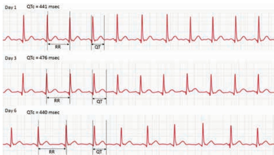
Figure 1: Rhythm strips used for QTc measurement. These rhythm strips were obtained from the patient's Apple Watch during the course of treatment. The QT and RR intervals are measured as shown and the QTc interval was calculated using Bazett's formula.

The waveforms provided by smart device-based ECGs have not been vigorously assessed for the purpose of QT measurement and no outcomes studies based on this strategy have been conducted to date. The rhythm strip obtained by such devices is typically derived from the same vector as lead I of a standard 12-lead ECG; the waveforms are overlaid on standard ECG grids with recordings at 25 mm/s and 10 mm/mV, allowing QT and RR interval measurements to be determined in milliseconds. The QTc interval can therefore be derived in the same manner as that adopted when using a standard 12-lead ECG. A