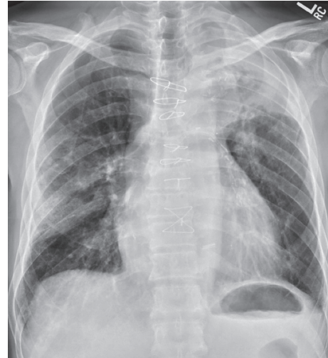
FIGURE 1: Chest radiograph on admission: multifocal pneumonia.

Given that Streptococcus pneumoniae is the most common bacterial cause of CAP in our population, the pneumococcal urine antigen test (PUAT) is a routine part of the inpatient evaluation of pneumonia at this institution. The positive likelihood ratio for the PUAT has been reported to be 15–20 [8].