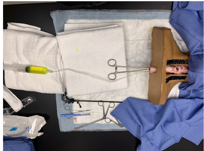
Figure 2 The setup used to inject fluorescein dye through an atomizer, representing aerosolized material, into the lower end of the porcine trachea. The simulated skin covering layer was removed to show the porcine trachea within the simulator.

X-ray cassette drape to cover the neck while performing cricothyrotomy allowed for the best visualization and that it was easy to manipulate. However, this drape did not allow a firm seal around the surgeon's hands, which allowed aerosolized materials to escape and cause contamination of the surgeon and the healthcare team. The dry OR towels were easy to manipulate but hindered visualization and easily slipped off the surgeon's hands, again exposing the surgeon to the aerosolization of materials from the airway. When using the wet OR towels to cover the operative site, all five surgeons agreed that the wet towels remained over the hands of the surgeon during the procedure. When discussing their observations from the black light test, they all agreed that all three drapes provided suppression of the aerosolization but that was dependent of how well the drape stayed covering the procedure field (see online supplementary video 1). Moreover, the surgeon-investigators reached a consensus advocating the use of wet towels during cricothyrotomy but acknowledged that while the reduction of the aerosolization using the wet towels came at the expense of some of the visibility, it did not hinder the ability to perform the procedure safely because cricothyrotomy is dependent on the tactile identification of the anatomical landmarks more than depending on visual cues. Table 1 summarizes the conclusion reached by the group of investigators.