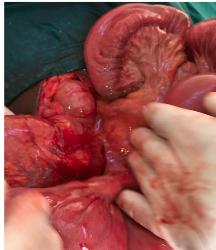
Fig. 2. Photos of intra-operative findings showing twisted cecum and terminal ileum with mesenteric concerned.