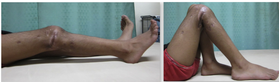
Fig. 5. Showing the range of motion at final follow up at 1 year.