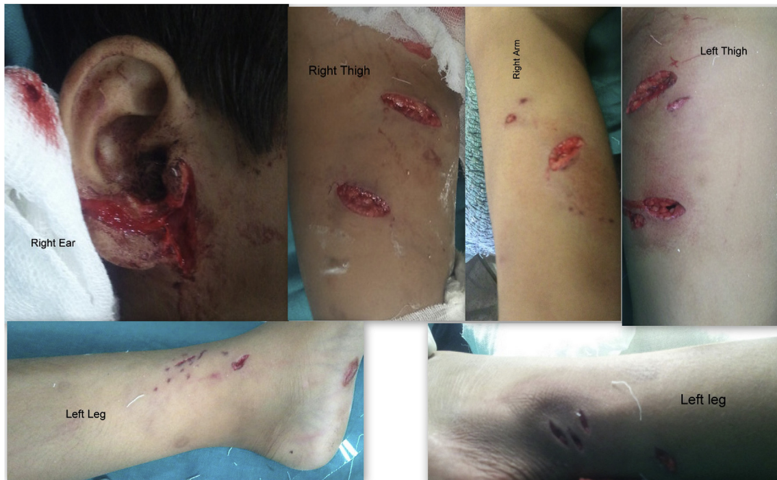
Fig. 1. Showing multiple lacerated wounds over right ear lobe, right thigh, left thigh, left leg and ankle region, and right arm.