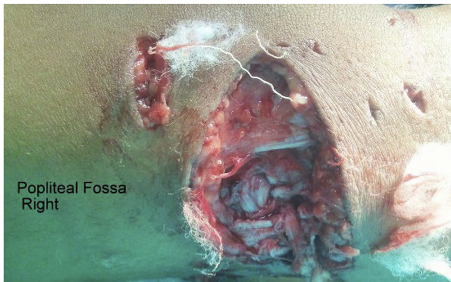
Fig. 2. Showing a large lacerated wound over the right popliteal fossa.

immunoglobulin and vaccine) were given to the patient and broad spectrum intravenous antibiotics in the form of Amoxycillin and Clavulanate combination was given for 5 days.