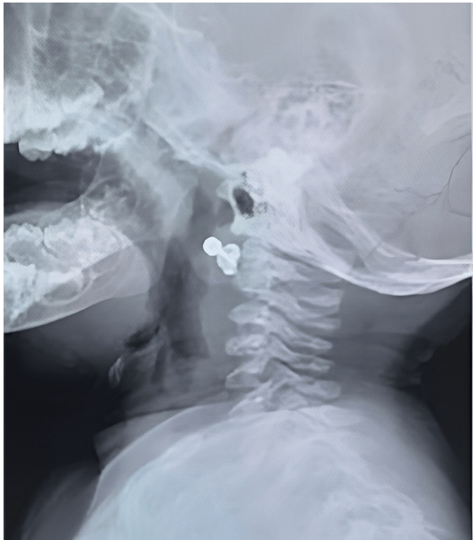
FIGURE 1: Lateral view neck X-ray

We decided to do a fiberoptic scope on the patient and accidentally found a foreign body glass between the vocal cord and planned to remove it in the operating room by bronchoscope. Intraoperatively by bronchoscope, we saw a piece of glass trapped between the vocal cords, with no damage to vocal cords or surrounding structures. There was evidence of mild reactive granulation tissue at the site of foreign body impaction (Figure 2).