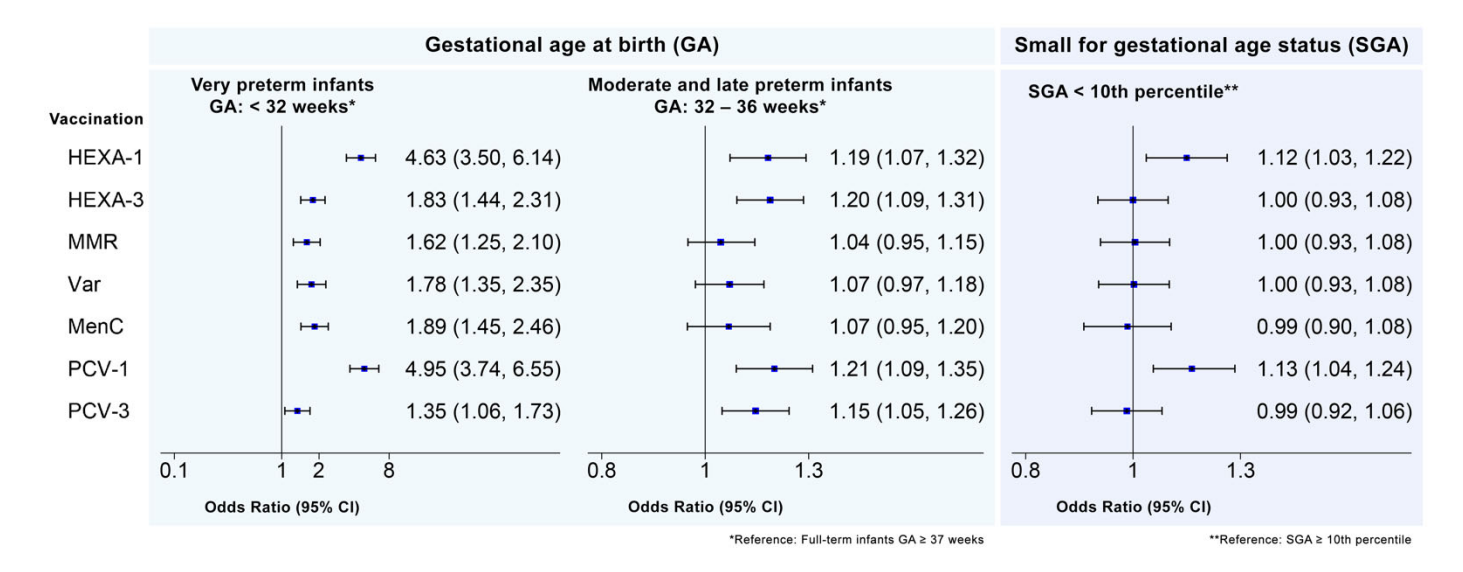
Figure 3. Forest plot reporting adjusted odds ratios (OR) of vaccination delay for preterm infants (compared to full-term infants) and SGA status (compared to infants who were not born SGA) for HEXA-1, HEXA-3, MMR, Var, MenC, PCV-1, and PCV-3 vaccine doses. * Reference: full-term infants GA \ge 37 weeks; ** Reference: SGA \ge 10 th percentile.

Table 4. Multivariate logistic regression models: determinants of delayed vaccination for first vaccinations (HEXA-1 and PCV-1) and for vaccine doses to be administered by 15th month of life (MMR, Var, PCV-3, and MenC).